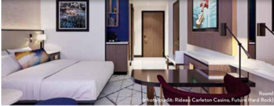
Room1

have three apiaries (beehives) at the property that produce over 400 bottles of honey each year. We already use the honey in our recipes at the property now and sell jars in our restaurants. That's an exciting opportunity for our guests, too."