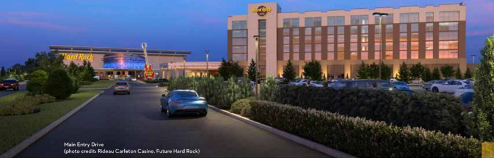
Main Entry Drive

Hard Rock Hotel and Casino scheduled to open first Canadian location in Ottawa