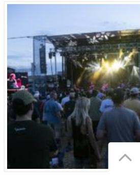
IAM SESSION LIVES UP TO ITS