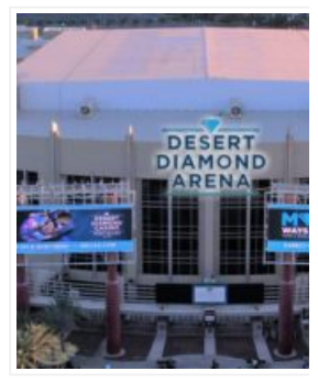
GILA RIVER BECOMES DESERT ARENA