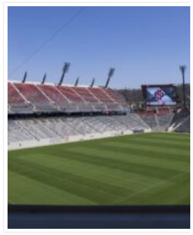
NEW PROGRAM: SNAPDRAGO