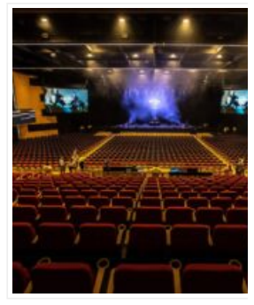
HARD ROCK UPS THE ANTE IN SACRAMENTO (MARKET FOCU