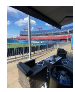
PARTY SHACK HITS SUITE SPO